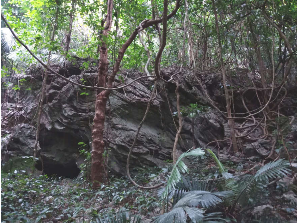
Figure 3. Habitat of Cyrtodactylus bobrovi in the limestone karst forest of Cuc Phuong NP