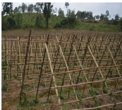
Figure 1. Soil protection by using coverage in LUT of Gymnema sylvestre

LUT of rice is the most effective LUT on soil environment due to annual acidity increase which is original from chemical fertilizers and pesticides. LUTs of rice and hybrid maize have been improved by using organic fertilizers, de-acidity by lime sprinkle.