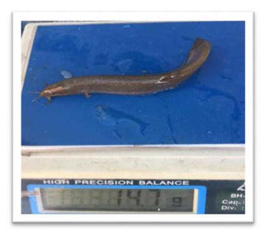
Figure 2. Initial and final fish from the fish tanks