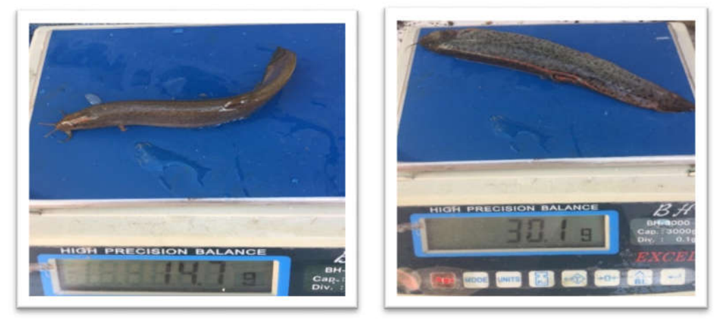
Figure 4. Initial and final fish from the fish tanks