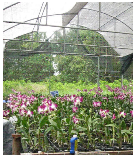
Fig. 1. The overview of experiment

Tukey's HSD multiple range test results were considered significant at p < 0.01 .